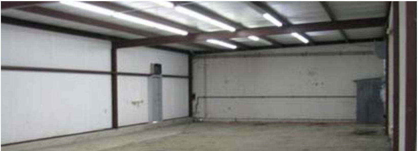
Small Unconditioned Warehouse