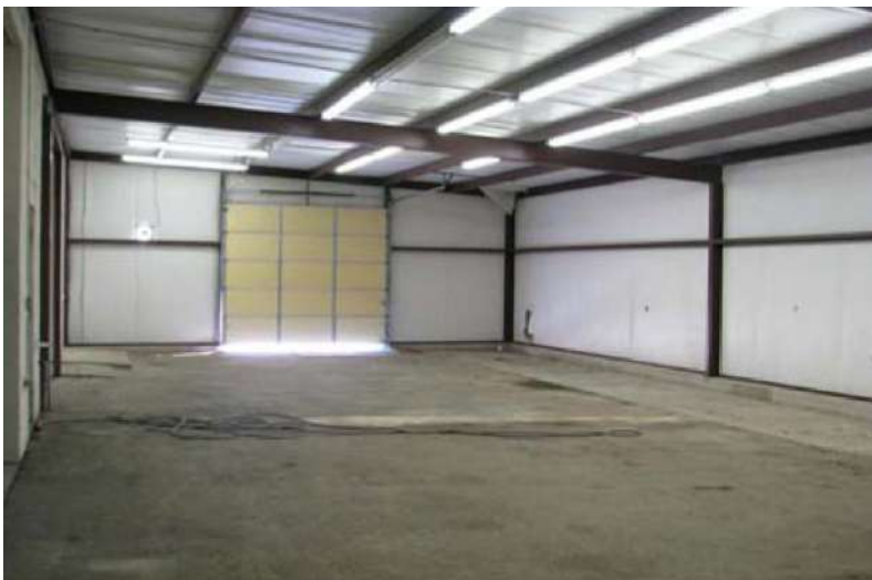
Small Unconditioned Warehouse