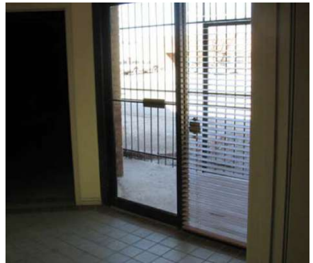
Front Door Lobby Area

ALL INFORMATION FURNISHED IS FROM SOURCES DEEMED RELIABLE AND IS SUBMITTED SUBJECT TO ERRORS, OMISSIONS, CHANGE OF TERMS AND/ OR CONDITIONS, PRIOR SALE, LEASE OR WITHDRAWAL WITHOUT NOTICE.